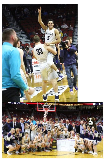
DES MOINES - The Xavier Saints finished their incredible journey with another state title Saturday night.