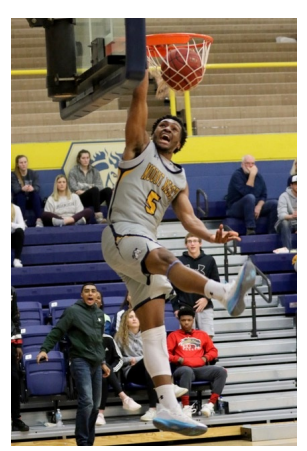
No juice. No joy.

That was the story for the Mount Mercy men's basketball team at the Hennessey Recreation Center Saturday afternoon.