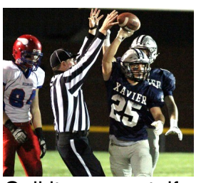
Call it an upset, if you like.

Written by Tom Fruehling Tuesday, 03 November 2015 00:35 - Last Updated Tuesday, 03 November 2015 00:48