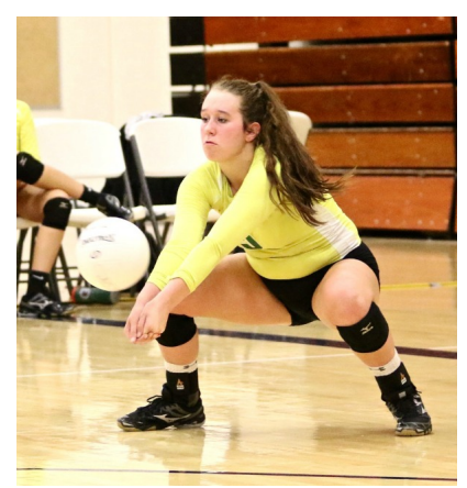
Perhaps they just plain pooped out.

Written by Tom Fruehling Saturday, 10 October 2015 20:35 -